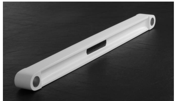
Fig. 3: I-Rod prototype

Fig. 3 shows an I-Rod prototype produced by the hybrid manufacturing process described above and painted afterwards.